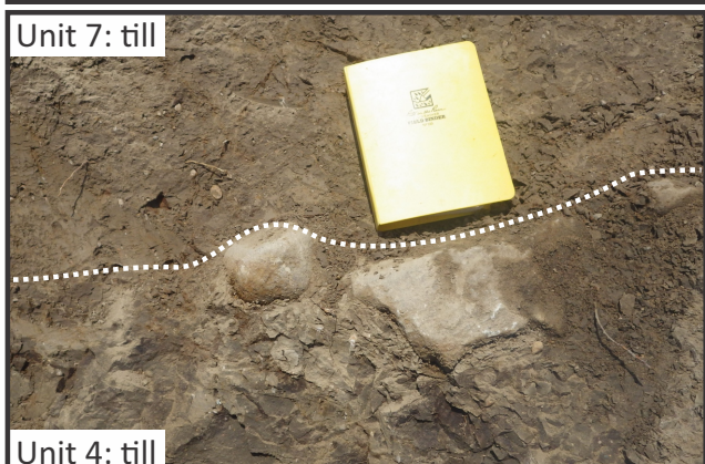
Unit 4: till